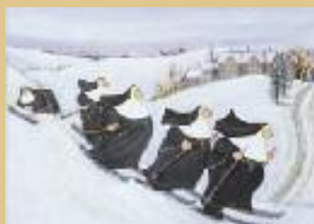
Skiing Nuns £3.25 (pack) Size 171 x 121mm