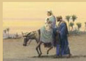
The Journey £3.50 (pack) Size 114 x 160mm