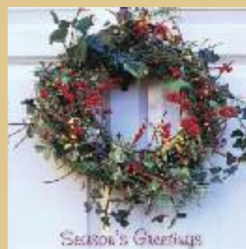
Christmas Wreath £3.00 (pack) Size 150 x 150mm