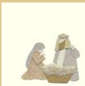
Nativity £3.50 (pack) Size 125 x 125mm