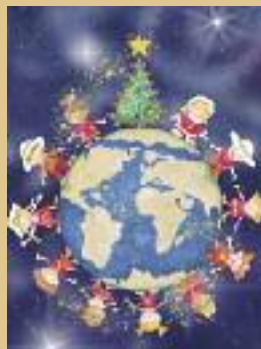
Children of the World £3.00 (pack) Size 98 x 130mm