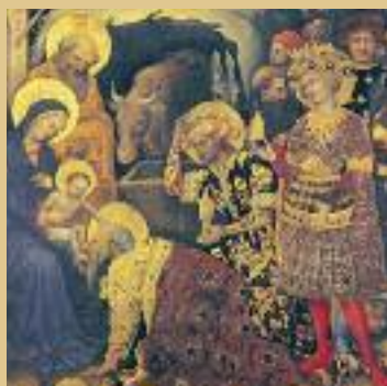
Adoration of the Kings £3.50 (pack) Size 141 x 141mm