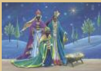
Adoration £3.50 (pack) Size 114 x 160mm