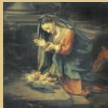
Our Lady Worshipping the Child £3.50 (pack) Size 125 x 125mm