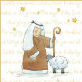
Little Shepherd £3.25 (pack) Size 117 x 117mm

All Christmas cards are sold in packs of 10 cards with envelopes