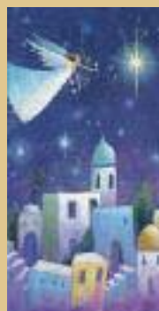
Angel Over Bethlehem £3.50 (pack) Size 84 x 170mm