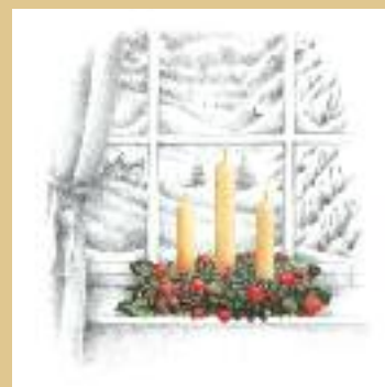
Candles in the Window £3.50 (pack) Size 125 x 125mm