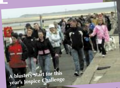
A blustery start for this year's Jospice Challenge

It is very important that we promote our work locally, and have events that supporters enjoy attending. Many of our supporters are very generous to us in making donations and we know you there is always a